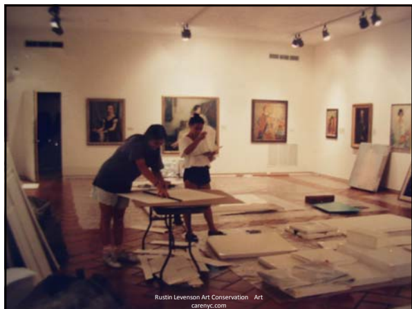
Rustin Levenson Art Conservation Art carenyc.com