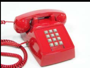
Rustin Levenson Art Conservation Art carenyc.com