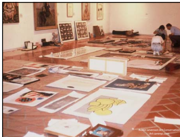
Rustin Levenson Art Conservation Art carenyc.com