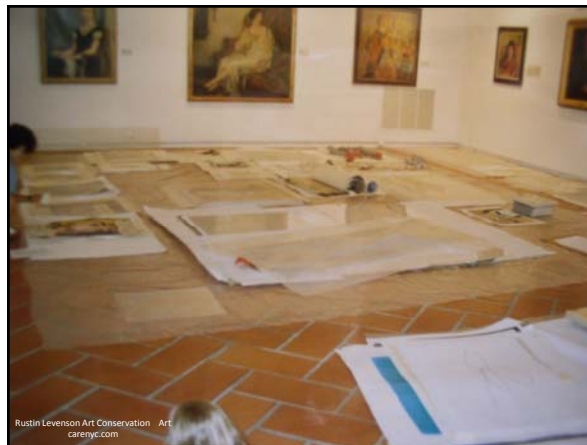
Rustin Levenson Art Conservation Art carenyc.com