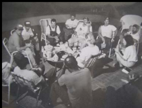
Rustin Levenson Art Conservation Art carenyc.com