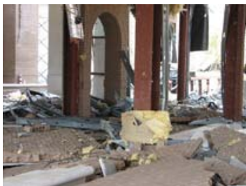
First Floor of the Jefferson Davis Presidential Library.