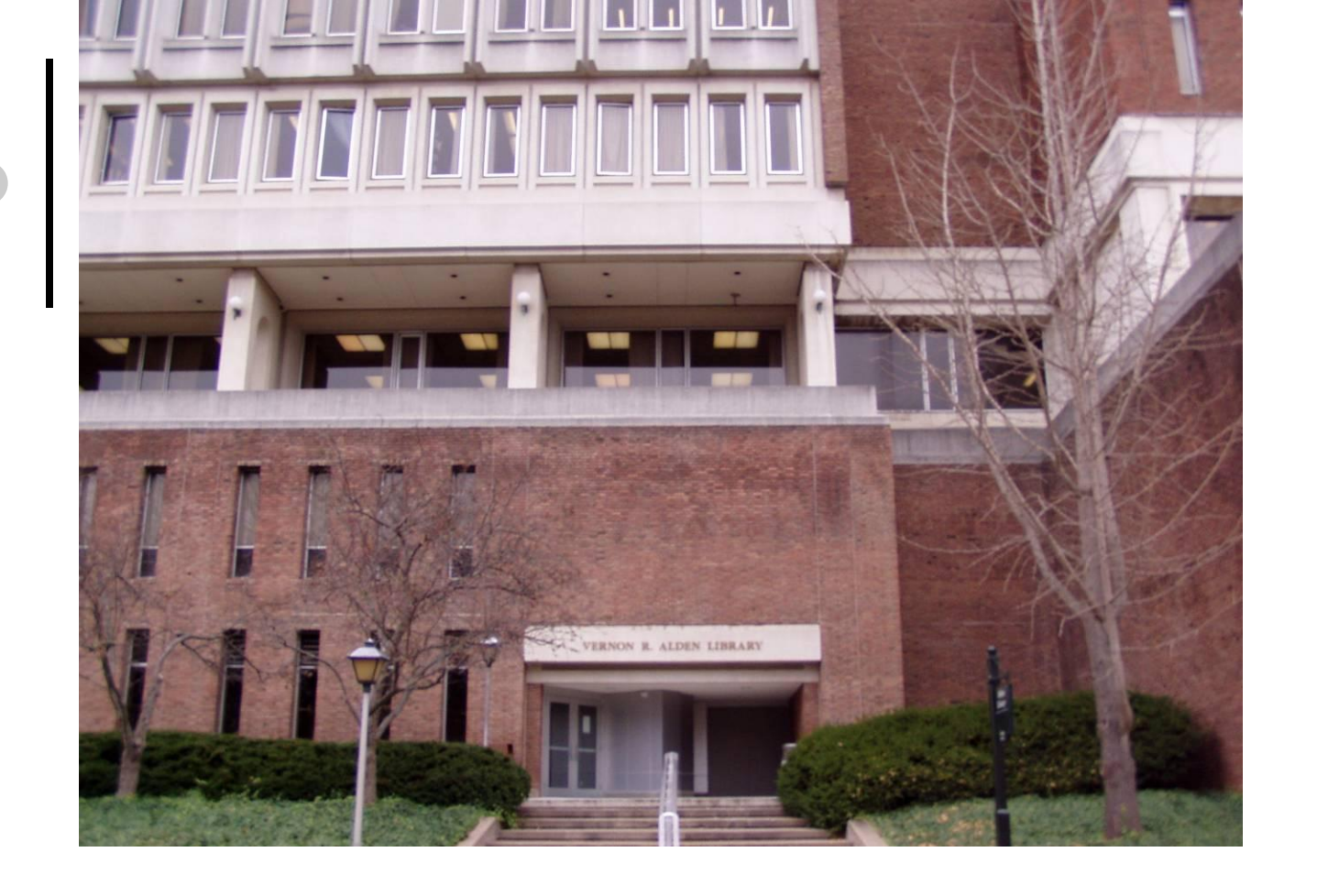
Leading Cause of Fire in Libraries is Arson