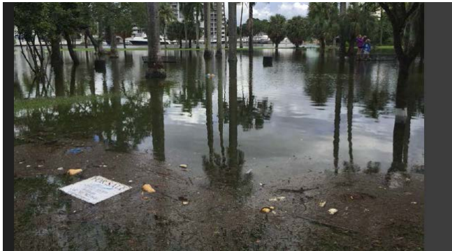
Here is a picture of the flooding at Sewell Park in Miami – over 18”.

The reports were plotted on a Google map with attached measurements and pictures. There was a report of more than 12 inches of flooding in central Virginia Key.