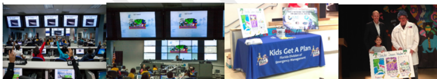
2014 Severe Weather Awareness Week