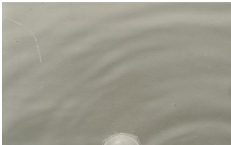
Figure 9. Pradip Malde, Wave. Particle. (Chris Bucklow), 2008. Platinum-palladium print from 8 × 10 in. negative, 24 × 19 cm. Water becoming body, head, thought waves, and the place from where light emanates—all of these rely heavily on and are only expressed by the form of the platinum/palladium print.