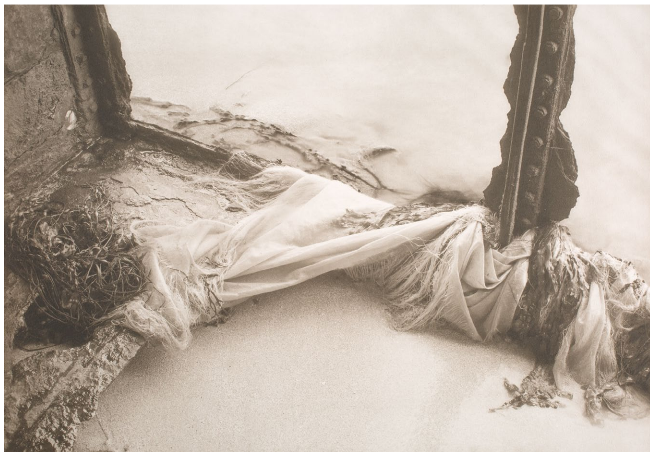
Figure 6. Mike Ware, Shrouded Blockship, Orkney , 1983. Platinum-palladium print from copy negative of 6 × 9 cm original, 28 × 40 cm. Ware’s print demonstrates that tone in platinum-palladium prints may be uniquely rendered by the process, and may not be monochromatic. Platinum-palladium prints may be very brown and almost golden or, if we look closely at this print, can range from brown to bluish. Tonal information is relative.

Resolution is a quality that is controlled by chemical and physical aspects of the process. It is not to be mistaken for sharpness of focus or film grain. Rather, it describes how the flow of tones in the negative splice with the dimensionality of the metallic and organic structures in the print. Resolution of detail is also related to the size of the original negative and the need for an exposure to be made with the negative in contact with the printing paper. 8 When a print is closely and patiently scrutinized, these highly resolved aspects of the image begin to unveil themselves (fig. 8; see also fig. 7).