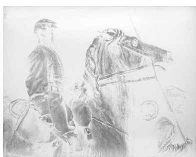
3e. Enlarged negative highlight mask, 11 x 14 in.