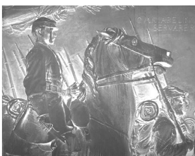
3d. Enlarged negative, 11 x 14 in.