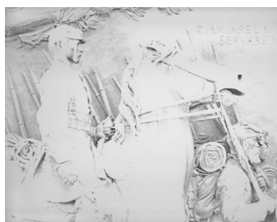
3c. Enlarged positive shadow mask, 11 × 14 in.