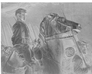
3b. Enlarged interpositive, 11 x 14 in.