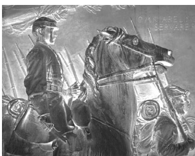
3f. Enlarged negative (3d) and highlight mask (3e) placed together in registration during contact printing. Masks extend the tonal range of the original negative to better match the spectral response of platinum-palladium chemistry, increasing contrast in highlights and shadows, which would otherwise appear flat.