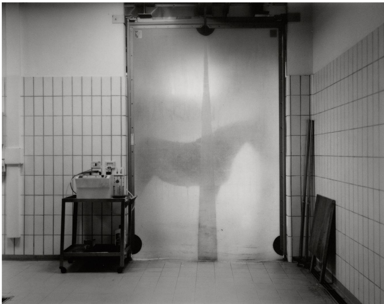
Figure 9. Andrea Modica, Bagnarola di Budrio, Italy , 2014. Platinum-palladium print on Canson Opalux translucent paper, 20.3 × 25.4 cm.