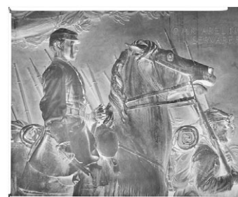
3a. Original gelatin silver negative, 8 × 10 in.