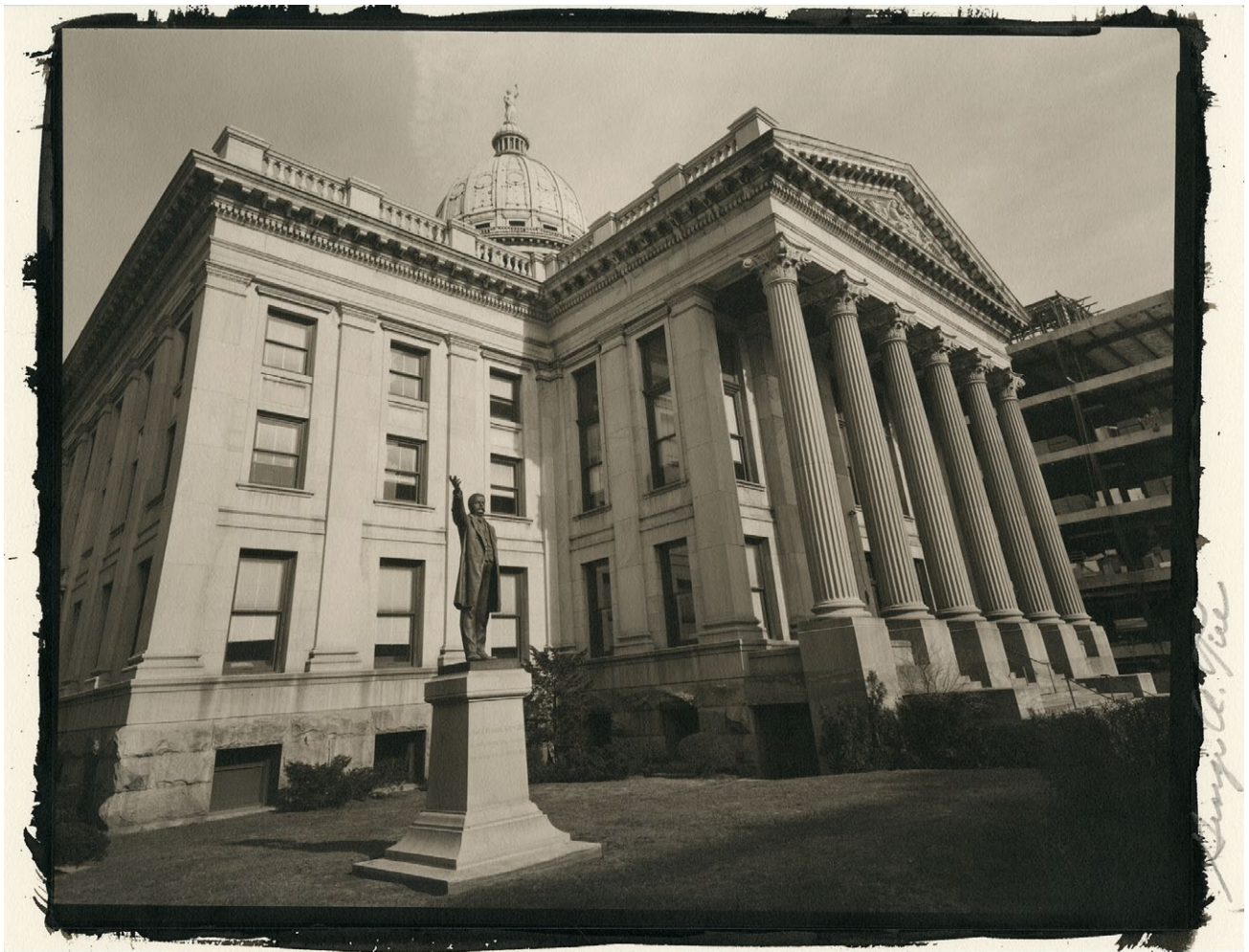
Figure 6. George Tice, Courthouse, Paterson, New Jersey , 1968. Print double-coated by brush with 100% palladium sensitizer on Crane's Lettra Ecu writing paper, 20.3 × 25.4 cm.

Penn preferred the following papers: Arches Aquarelle Hot Press, Bienfang Admaster 406, Rives Bristol 100, Strathmore Carillon, and Wiggins Teape. 63