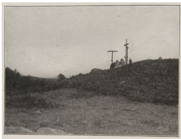
Figure 8. F. Holland Day, Calvary . From Art Interchange 43, no. 2 (August 1899): 30.

Assembling the newly discovered negatives with all of the other known images revealed to us that the Crucifixion series was more expansive than previously understood (figs. 8–11; see also fig. 7). As Day advocated, he had orchestrated a comprehensive sacred series concerning