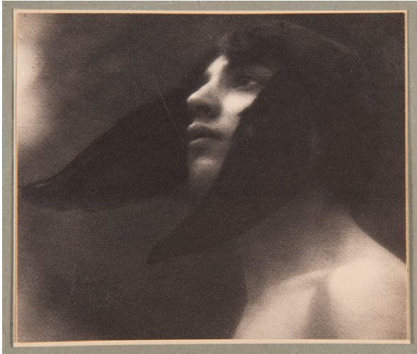
Figure 2. F. Holland Day, [ Youth with winged hat, cropped at chest ], 1907. Platinum print with hand coloring, 13.2 × 15.6 cm. Library of Congress, Prints and Photographs Division, The Louise Imogen Guiney Collection, PH-Day, (F.), no. 347 (A size).

allegories and feature Christian or sacred subjects (fig. 2). Printed either with the help of his friend, the Boston studio photographer Frank W. Birchall (1857–1916), or by Day himself after he took up darkroom work, each photograph was executed, and often mounted, with meticulous care.