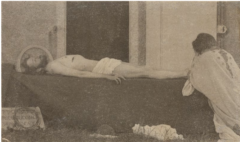
Figure 10. F. Holland Day, [ Entombment with Mary at right ], 1896. Platinum print, 6.3 × 9.5 cm. Private collection.