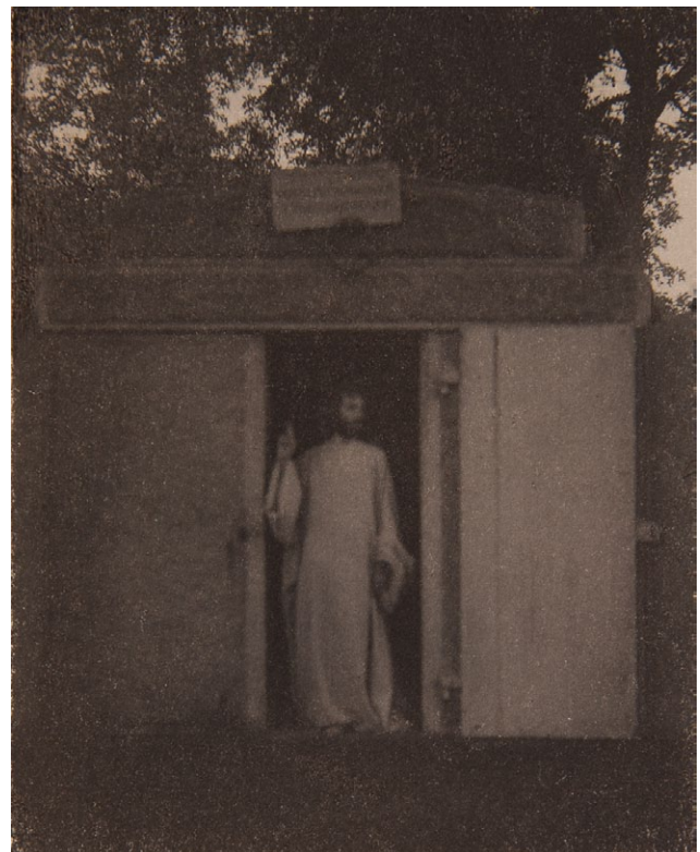
Figure 11. F. Holland Day, [ Christ's Resurrection from the tomb ], 1896. Platinum print with hand coloring, 15.1 × 12.2 cm. Library of Congress, Prints and Photographs Division, The Louise Imogen Guiney Collection, PH-Day, (F), no. 137 (A size).

That each LOC image has an identical image in the other set (fig. 12) poses a contradiction. The vignette appearance suggests that the prints were developed by selectively applying glycerine-diluted developer with a brush. 20 But because this method of platinum printing involves applying the developer by hand, it is impossible for two prints to be identical. To reiterate, each glycerine-developed print is necessarily unique, and that precludes the possibility of identical prints, such as those at the LOC.