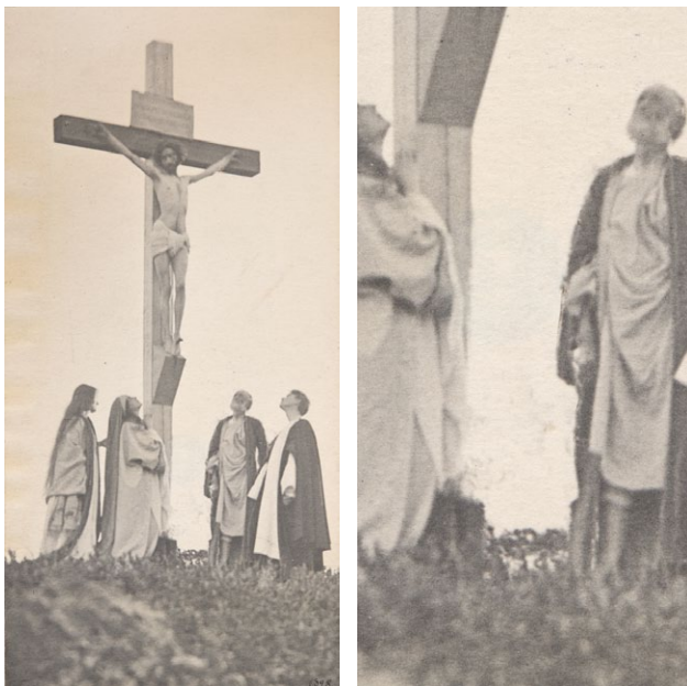
Figure 7. F. Holland Day, [ Crucifixion, frontal, with Mary, Mary Magdalene, Joseph and St. John (?) ], 1898. Platinum print, 17.7 × 8.8 cm. Library of Congress, Prints and Photographs Division, The Louise Imogen Guiney Collection, PH-Day, (F), no. 129 (A size). This contact print was made from the negative shown in figure 6.