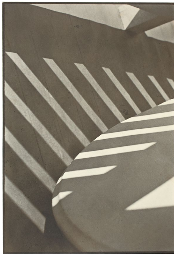
Figure 2. Paul Strand, Porch Shadows , 1916. Platinum-silver print, 33.1 × 22.9 cm. The Art Institute of Chicago, Alfred Stieglitz Collection, 1949.885, www.artic.edu. © Aperture Foundation Inc., Paul Strand Archive.