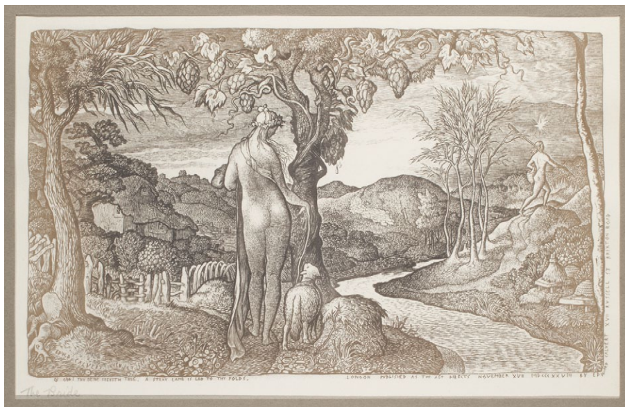
Figure 3. Frederick H. Evans, The Bride . Platinum-silver print, 14.0 × 22.6 cm. From Frederick H. Evans, Nine Early Engravings by Edward Calvert: Facsimile Enlargements from the Originals Made on Copper, Wood & Stone MDCCCXXII—MDCCCXXXI (privately printed, 1915). National Gallery of Art Library, Department of Image Collections, Album P164. The center of the print, which was protected from atmospheric influences more than the edges, remains neutral in hue, while the edges display greater evidence of sulfiding (brown hue) and oxidation (fading).

A platinum-silver print by Frederick Evans from a 1915 portfolio of reproductions of engravings printed in a “permanent process” displays a shift from neutral to warm (fig. 3). 6 X-ray fluorescence spectrometry (XRF) indicates that this print is platinum-silver, most likely a Satista print. 7 The high-contrast image of this print changes from black in the central portion to sepia at the perimeter. Barro speculated that the fading and shift toward sepia are due to silver sulfiding, a hypothesis supported by XRF. The image density in the Evans print would have initially been uniformly black throughout, and, as expected, XRF measurements show that the ratios of silver to platinum are consistent from the image at the center to the image at the edges. XRF also reveals an increase in the sulfur content from the blacker image in the center to the more sepia edges. Apparently, air, moisture, and pollutants migrated into the edges of the portfolio and caused this localized deterioration. Other prints in the portfolio show varying degrees of color shift depending on their location within the stack: prints toward the center, where they were protected from atmospheric influences by the mass of other prints in the stack, are more neutral in hue overall. Those near the top and bottom, where they were less shielded from atmospheric conditions, are more sepia.