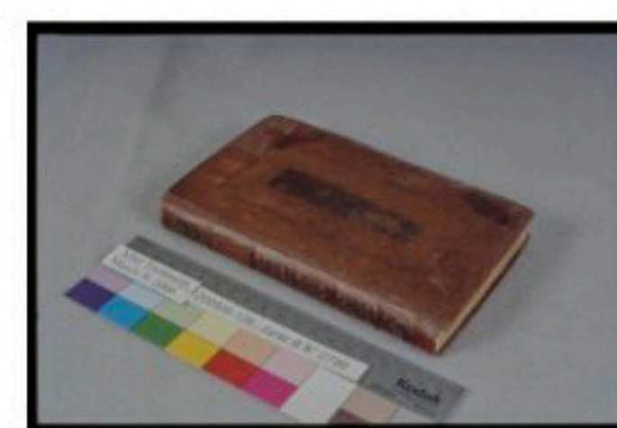
2006 board repair and reattachment to Propagation of the Gospel in the East