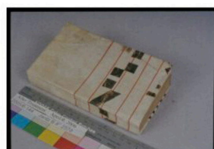
2006 surface cleaning of Quadratum alchymisticum