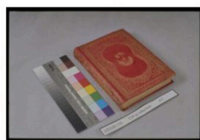
2006 board reattachment, hinge repair, spine repair, and page repairs for digitization of Affection's