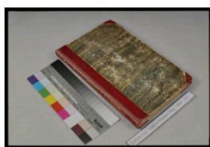
2006 board reattachment, hinge repair, spine repair, stain reduction, and page repairs for digitization of Affection's