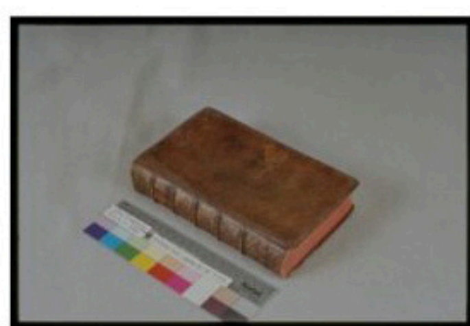
2006 board reattachment and minor structural repair to Vollständiger und neuerläuterte deutsche Sprachkunst

This project was made possible in part by a 2021 award from the Catalyst Fund at LYRASIS and it was additionally the recipient of the inaugural 2021 Sandy Nyberg Award. The Sandy Nyberg Award recognizes proposals that demonstrate the highest levels of innovation in the areas of preservation, conservation, collections, writing and publishing.