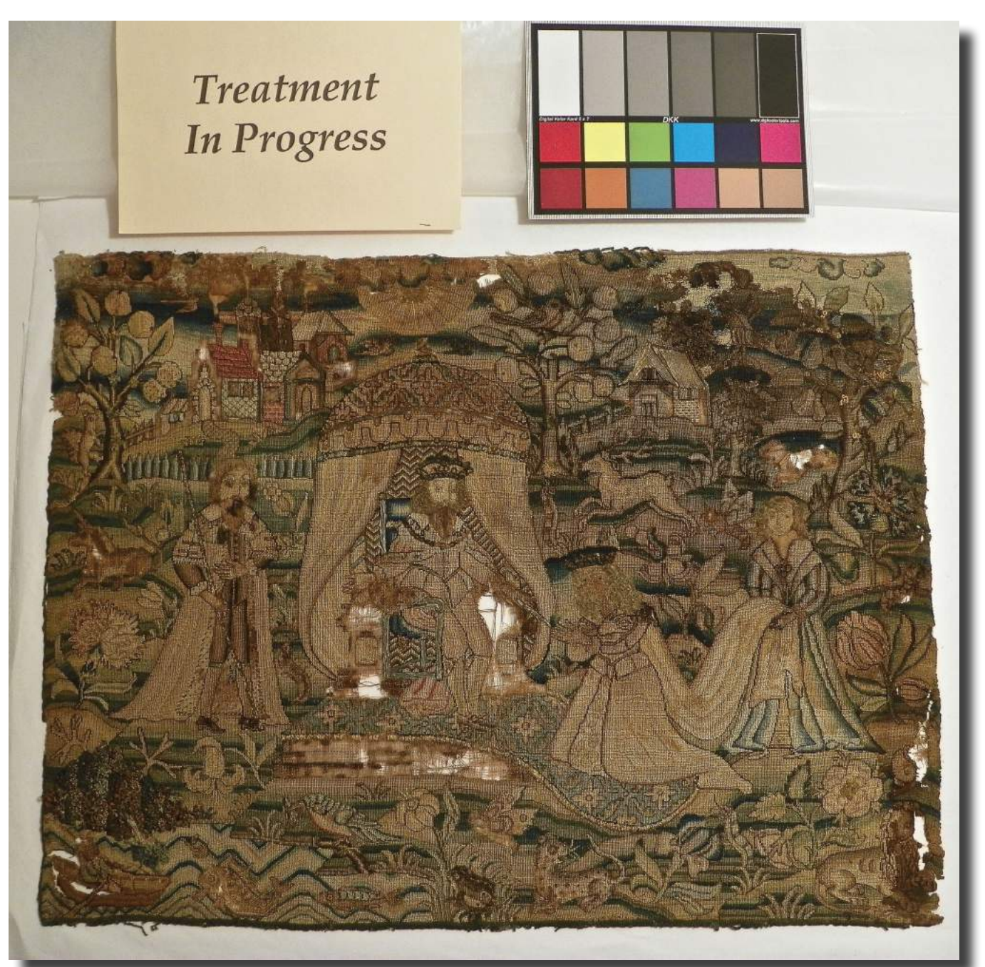
Treatment in Progress Post - cleaning

Before Treatment Conservation of a Jacobean English Embroidered needlework that pictured a royal visitation scene set in a fantastical pastoral landscape with symbolic flora and fauna.