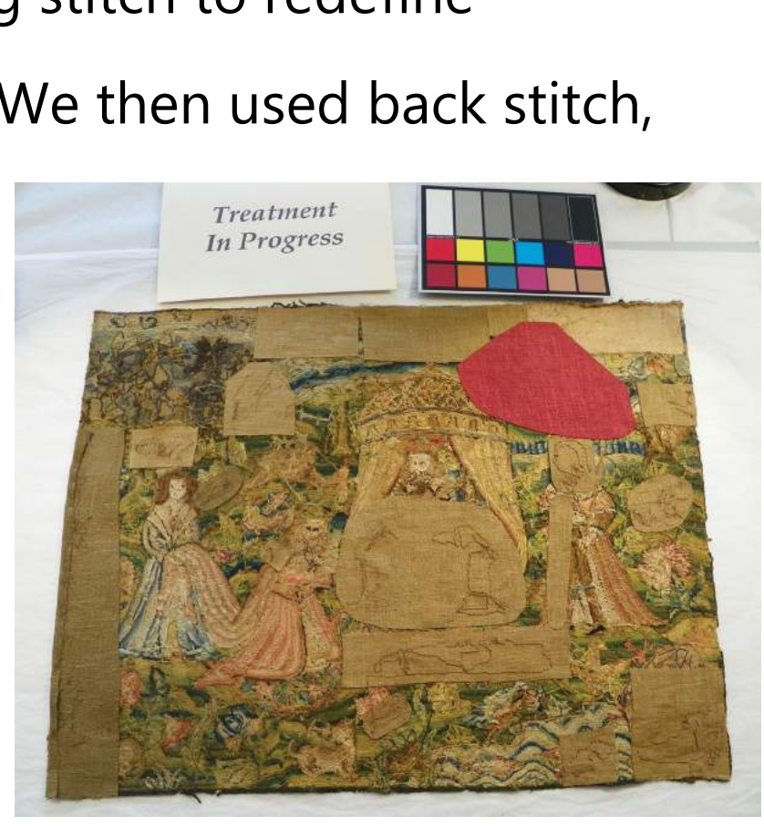
Figure 6 Reverse view of color matched patches