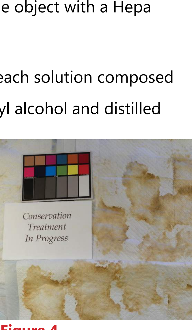
Figure 4 A selection of the cleaning pads with dirt removed from upper right corner

Color Match and Dye After careful consideration of approach, we decided to hand dye fine weave linen patches to fill holes and blend tears. These were color matched to the missing areas (figure 6). The dark neutrals we chose matched the faded colors of the piece and became perfectly blended as stabilization patches even when they showed through to the front.