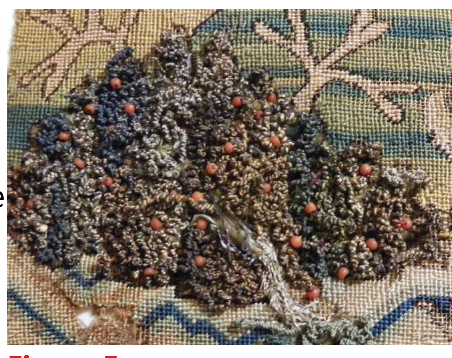
Figure 5 Detail of decorative element secured

darning stich and invisible couching stitch to stabilize the frayed and broken areas, holes and tears, and for mounting at the end of the project. (Figure 5, 6).