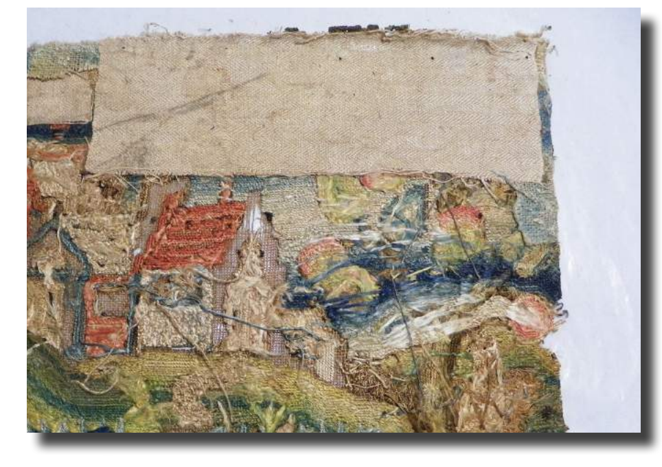
Figure 1 Rabbit skin glue patch attached to upper left verso

knowledge I had gained from studying and creating textiles during my years of craft training were fundamental in the treatment of this needlepoint. Under the constant supervision of Ms. Rousseau as principal conservator, we considered and tested a number of the techniques I had worked with as an art student, such as dyeing, hand stitching, needlepoint, and embroidery.