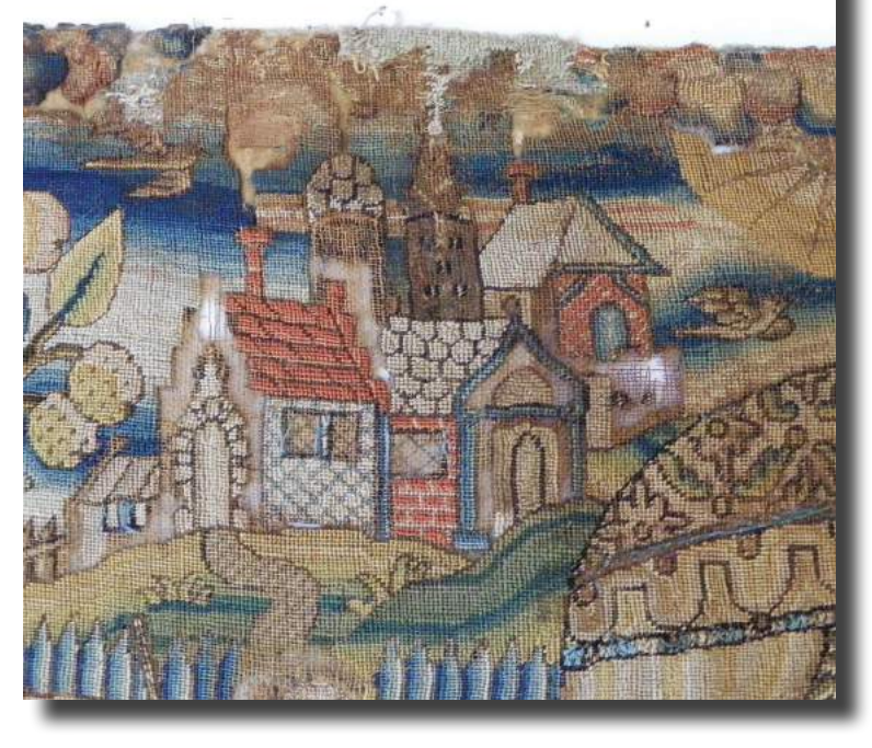
Figure 2 Significant discoloration in upper right corner